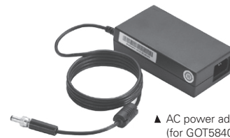
▲ AC power adapter (for GOT5840T-845-J)