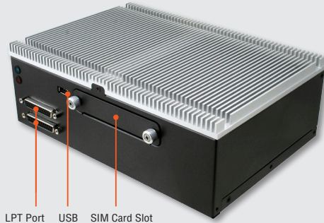
LPT Port LVDS Port USB SIM Card Slot Swappable 2.5" Drive Bay