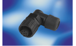
View represents all available contact positions.