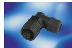
View represents all available contact positions.