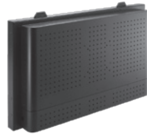
▲ Rear view