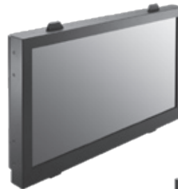
▲ Side view