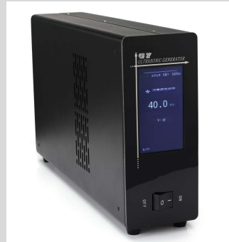
The front of vertical type