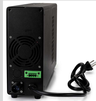
The Back of vertical type