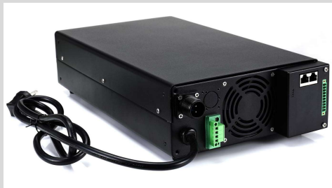
The back of horizontal type