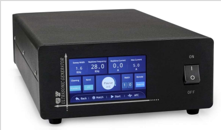
The front of horizontal type