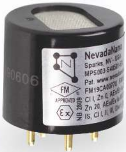
*S4 Intrinsically Safe

With its robust industrial design, the MPS doesn't drift, decay, or poison and requires no maintenance over its lifetime. And with its data-rich reporting capabilities, the MPS will instantly let you know if a fault exists and why.