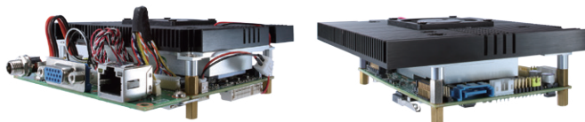
▲ Assembly view